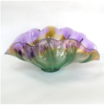
Clamshell Bowl, Silver-Green & Purple $978.00

Another of our large clamshell bowls colored with silver-green. [Product Details...]