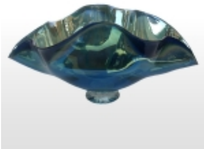
Clamshell Bowl, Aquamarine & Cobalt Blue $897.00

This bowl has a brilliant cobalt on the inside and is illuminated with white and lava grey on the outside. [Product Details...]