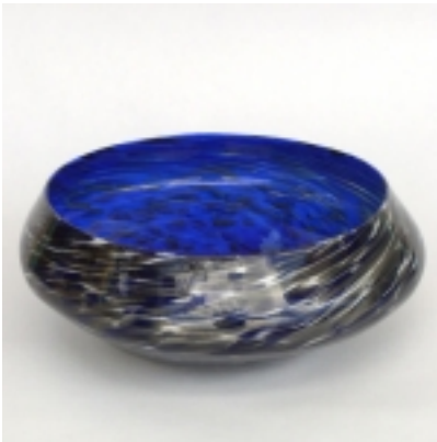
Big Island Bowl $398.00

Add a touch of Aloha to your home or office decor with our hand-blown crystal bowls. Our designs and colors are inspired by the rainbows, skies, and ocean scenery found in our Islands.