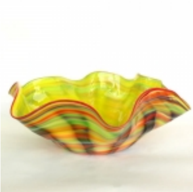
Sunshine Bowl $697.00

Bring the colors of Hawaii to your home decor with this bowl. [Product Details...]