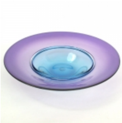
Gem Stone Bowl $877.00

Another of our large clamshell bowls colored with silver-green. [Product Details...]