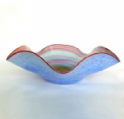
Rainbow Bowl $657.00

This hand blown crystal bowl brings soft patterns and colors of ocean waves to your home. [Product Details...]